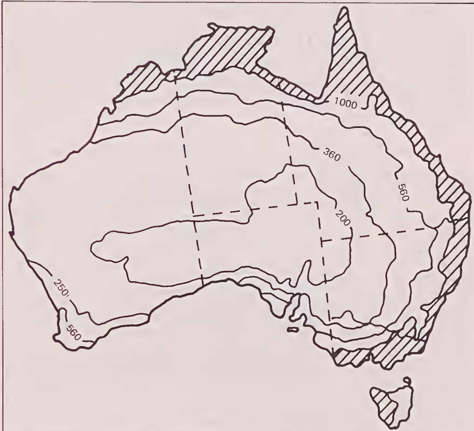
Fig. 3. Annual precipitation in Australia (mm). (Adapted from Fig. 10-7, p. 96 of Linaere & Hobbs (1977). 'The Australian Climatic Environment'. (Wiley: New York.)

Knowledge of the distribution of mosses in Australia is not as advanced as that in the Northern Hemisphere such as North America (Steere 1965, 1976, 1979; Ireland et al. 1980; Schofield 1965, 1980) and Britain (Smith 1976); or South Africa (Sim 1926; Magill & Schelpe 1979) and New Zealand (Sainsbury 1955; Martin 1951) in the Southern Hemisphere. Indeed there are few published analyses of moss distributions in Australia, but Herzog (1926) mentions some Australian species, Scott & Stone (1976) include distributional data (by state) for many Australian species as well as lists of species with ecological preferences, while Catcheside (1980) divides South Australia into 21 areas noting the area(s) in which each of the 187 species described is located and also provides a more detailed analysis of geographical relationships of the species (Catcheside 1982). Some information is also available for individual families, e.g. Polytrichaceae (Smith 1972); Hypnodendraceae (Touw 1971); Hookeriaceae (Welch 1970); Bryaceae (Ochi 1970, 1972, 1973); Hypnaceae (Ando 1980); or genera such as Bryum (Mohamed 1979); Hypnum (Ando 1972); Mittithyridium (Nowak 1980); Atrichum (Nyholm 1971); Macrocoma (Vitt 1973); Dawsonia (van Zanten 1973), to mention a few, where worldwide revisions have been undertaken. In most cases, even when herbarium collections from Australia have been studied, the distribution has not been determined from recent field collections and the data will, therefore, be incomplete.